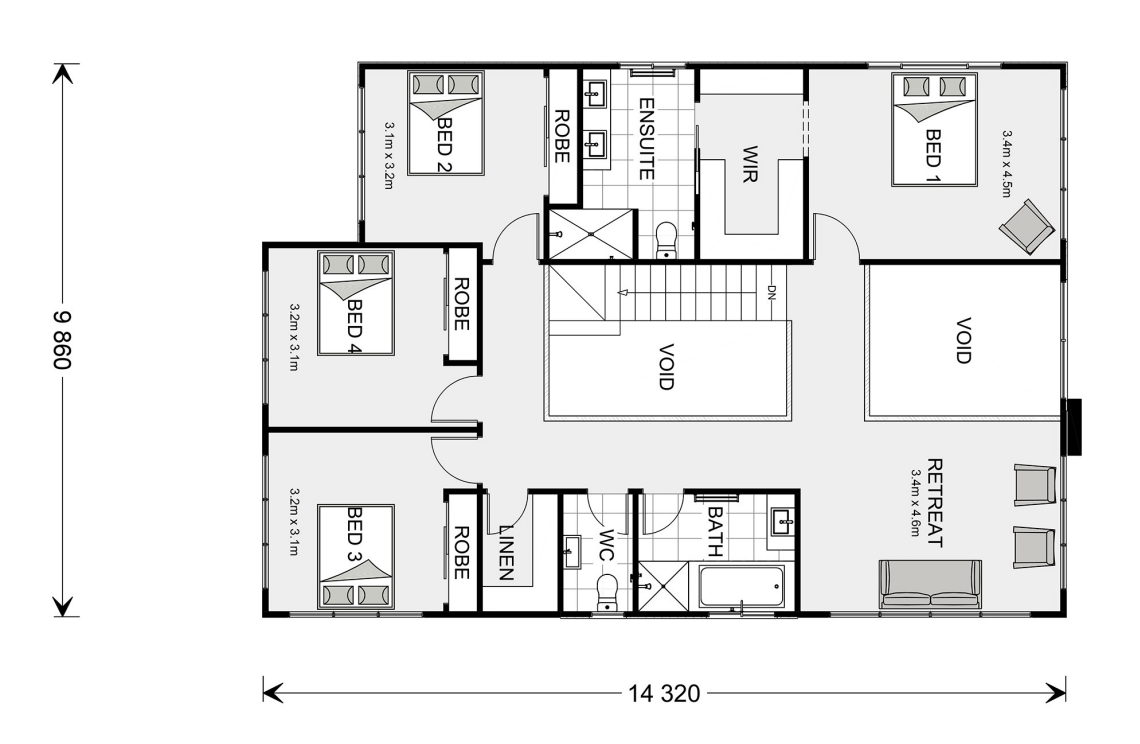
* Package price is based on Castaway 335 standard floor plan and standard façade (may be smaller than façade shown). Package may be subject to developer's design review panel, council final approval and G.J. Gardner Homes procedure of purchase. Package price excludes stamp duty on land, legal fees and conveyancing costs (including 6 Legal/74189757_2 transfer of title and searches). Prices are current as of May 9, 2024 and are inclusive of GST. Prices may change without notice. Packages are subject to availability. Package subject to two separate contracts relating to the building and the land respectively. Photographs may depict fixtures, finishes and features not supplied by G.J Gardner Homes. Excluded items may include but are not limited to landscaping items such as planter boxes, retaining walls, water features, pergolas, screens, driveways and decorative items such as fencing and outdoor kitchens or barbeques. Photographs may also depict inclusions not forming part of the standard design and which may be subject to additional costs. This design and illustration remains the property of G.J Gardner Homes and may not be reproduced in whole or in part without written consent. For detailed home pricing, please talk to a New Homes Consultant or visit our website at https://www.gjgardner.com.au/house-and-land-pricing. TT Holdings Qld. Pty. Ltd. trading as G.J. Gardner Homes Sunshine Coast South. Builders License 1121765.