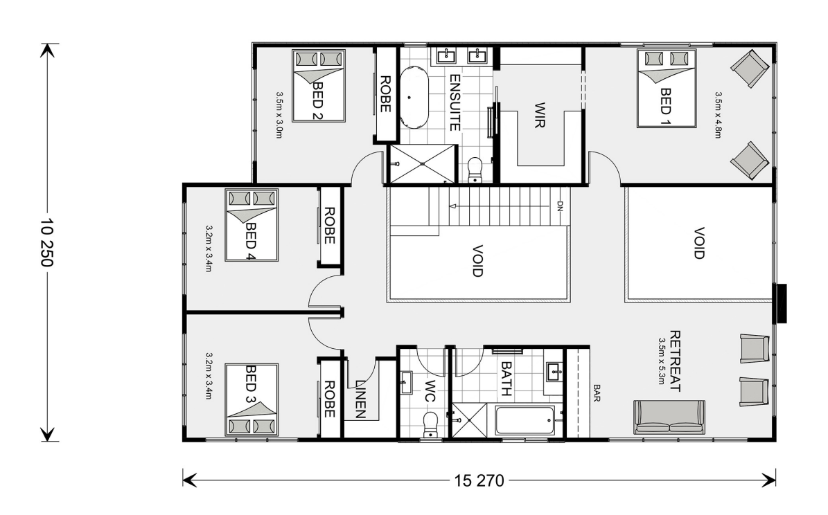
* Package price is based on Castaway 370 standard floor plan and standard façade (may be smaller than façade shown). Package may be subject to developer's design review panel, council final approval and G.J. Gardner Homes procedure of purchase. Package price excludes stamp duty on land, legal fees and conveyancing costs (including 6 Legal/74189757_2 transfer of title and searches). Prices are current as of May 9, 2024 and are inclusive of GST. Prices may change without notice. Packages are subject to availability. Package subject to two separate contracts relating to the building and the land respectively. Photographs may depict fixtures, finishes and features not supplied by G.J. Gardner Homes. Excluded items may include but are not limited to landscaping items such as planter boxes, retaining walls, water features, pergolas, screens, driveways and decorative items such as fencing and outdoor kitchens or barbeques. Photographs may also depict inclusions not forming part of the standard design and which may be subject to additional costs. This design and illustration remains the property of G.J. Gardner Homes and may not be reproduced in whole or in part without written consent. For detailed home pricing, please talk to a New Homes Consultant or visit our website at https://www.gjgardner.com.au/house-and-land-pricing. Vision Pacific Design and Construction Pty Ltd trading as GJ Gardner Homes - Port Macquarie. Builders License 348443C.